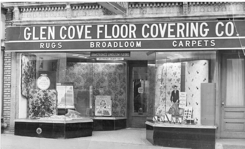
The first store opened in 1932 at 68 Glen Street as Glen Cove Floor Covering Co.